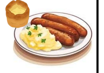
Sausage Yorkshire pudding